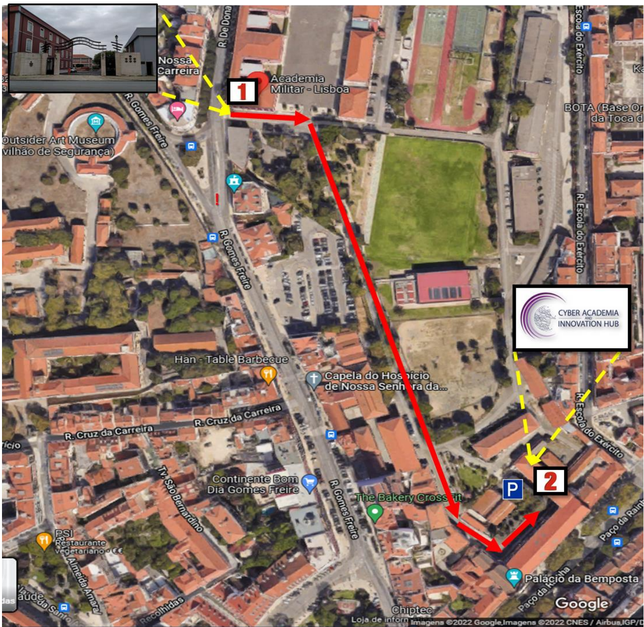
Figura 1 – Acesso ao Cyber Academia and Innovation Hub.